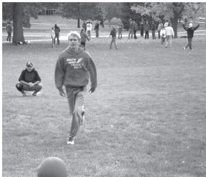
Six teams participated in the Youth Group Kickball Tournament at Luther College on Oct. 11 as part of the Jesus, Justice, Jazz concert to raise money for world hunger.

The concert event was sponsored by the Northeastern Iowa Synod Lutheran Youth Organization and