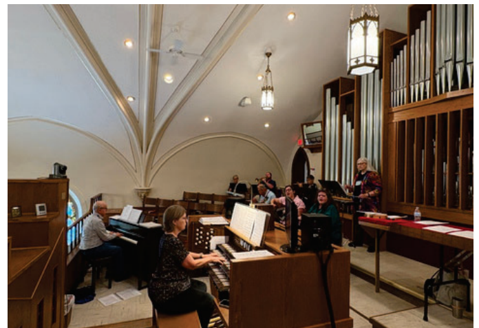
Musicians who participated in leading Worship