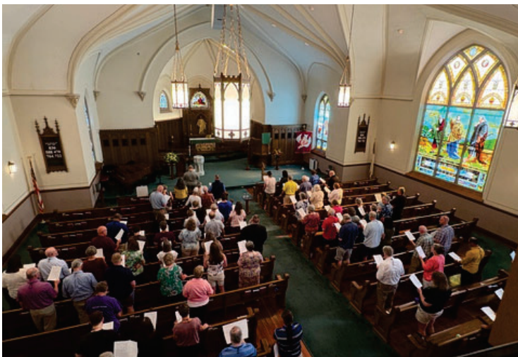
Gathering Worship at C3

June 2027 will be a synod assembly with a synod bishop election.