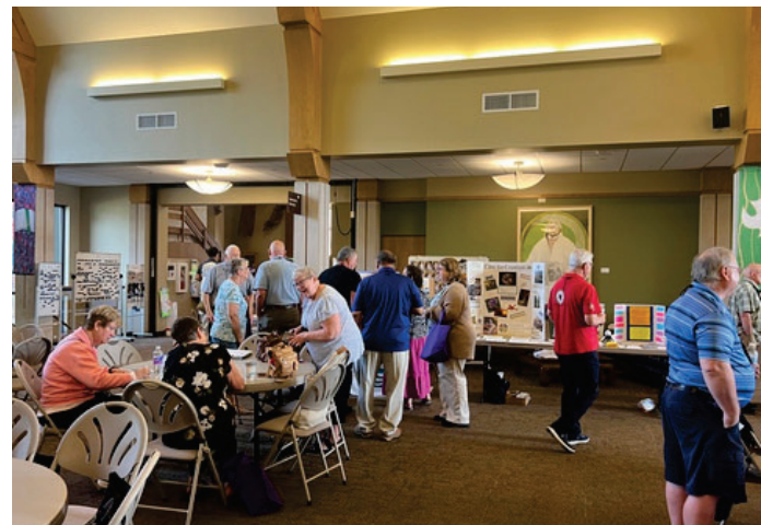
Network display tables outside the Sanctuary & Parish Hall