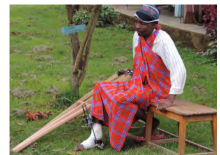
Patient at Nkoaranga Hospital, Tanzania

GHM appreciates any financial gift to defray shipping costs to the final overseas destination. Please mail financial gifts separately, not in the bandage boxes.