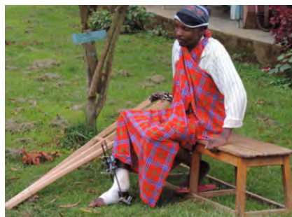
Patient at Nkoaranga Hospital, Tanzania

GHM appreciates any financial gift to defray shipping costs to the final overseas destination. Please mail financial gifts separately, not in the bandage boxes.